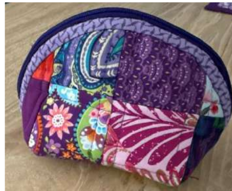
Patchwork hand stitched zipper bag(left).